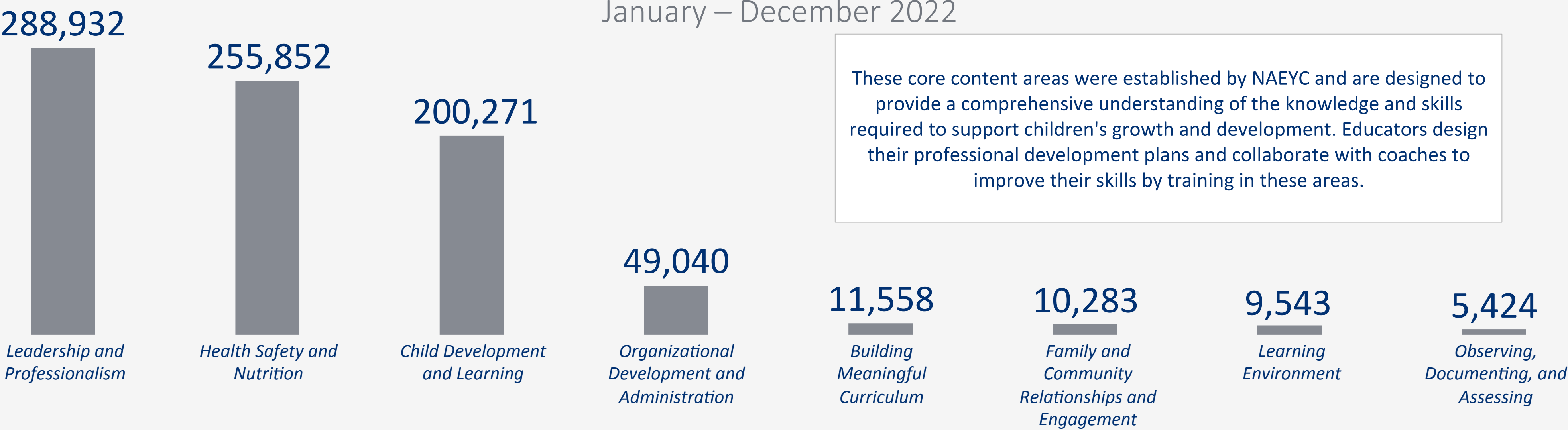
Training Hours by Core Content Areas January – December 2022

These core content areas were established by NAEYC and are designed to provide a comprehensive understanding of the knowledge and skills required to support children's growth and development. Educators design their professional development plans and collaborate with coaches to improve their skills by training in these areas.